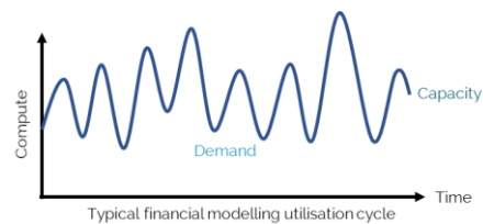
Figure 2 - Perfectly matched demand and supply with cloud resources

The variability and unpredictable nature of the financial modelling universe is ideally addressed by the “pay for what you use model” of cloud computing.